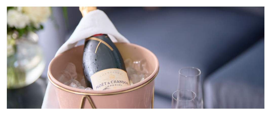
Please see your Wedding Co-ordinator for rates specific to your date.

Two complimentary deluxe rooms on the night of the wedding and 20 rooms at a 15% discount